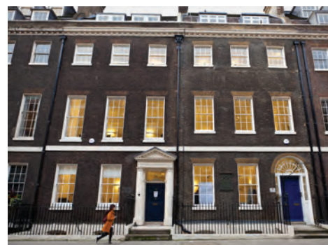
Arcadia London Center

The College of Global Studies is truly an international institute of higher education. We staff and maintain centers around the world. Each center is headed up by a Regional Director or Resident Director, who are seasoned academic and higher education administrators, and are very familiar with the needs of American study abroad students. Our centers are designed to provide high-quality academic content, co-curricular programming, student support, teaching and learning opportunities, and engagement with the local community.