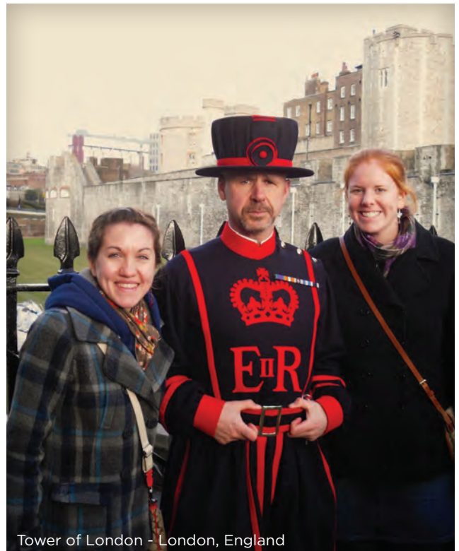
Tower of London - London, England

Don't be too concerned if your son or daughter has some ups and downs while they adjust to life in their new country. Cultural adjustment, sometimes referred to as culture shock, is very normal and all students experience it to some degree. Arcadia staff members are very experienced in helping students to cope with the challenges of living in an unfamiliar place and adopting healthy mechanisms to take advantage of the profound personal and intellectual growth opportunities presented by international study. For more details, please see our Cultural Adjustment section on the web.