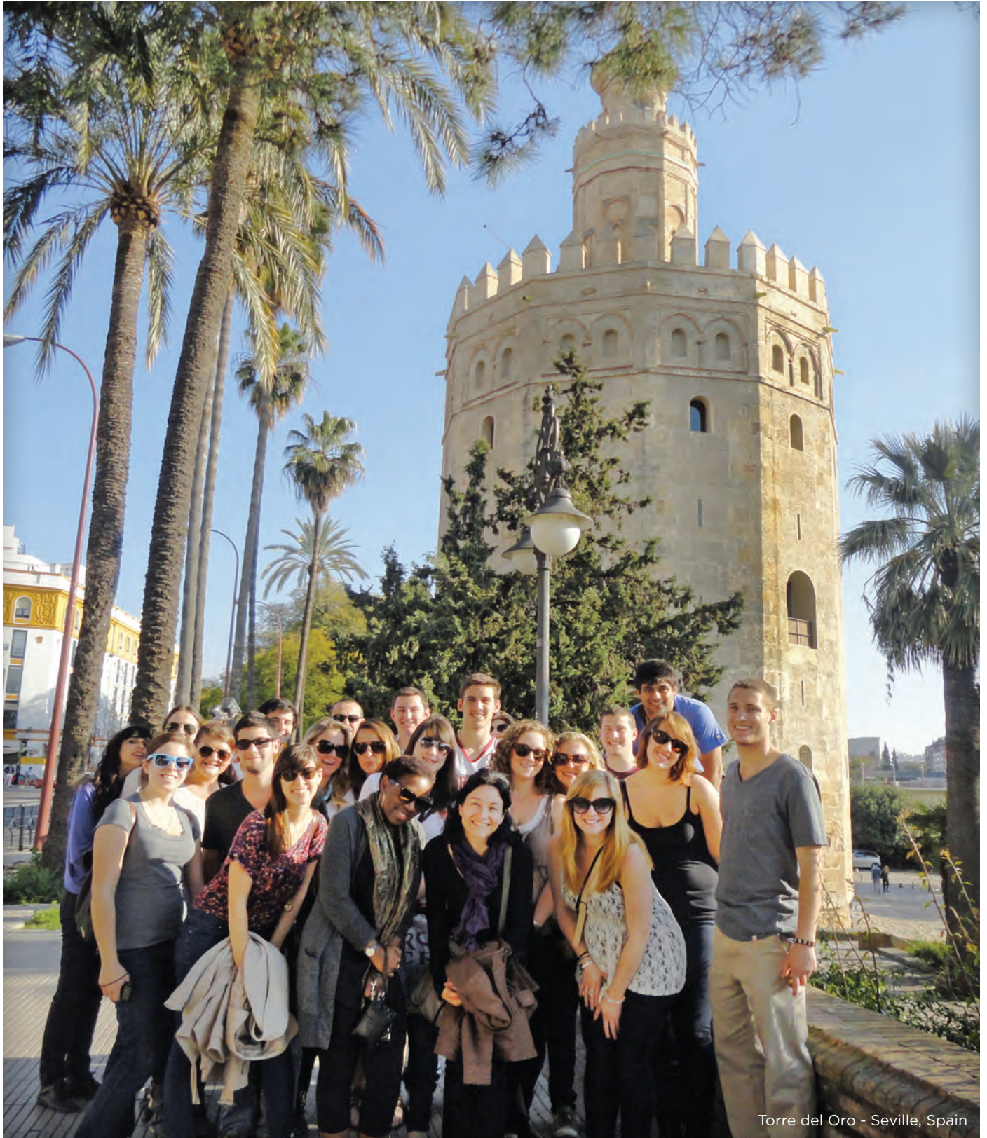
Torre del Oro - Seville, Spain