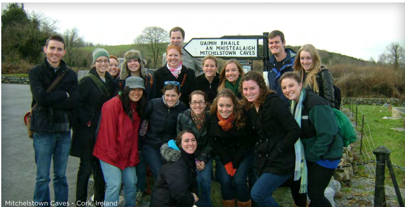
Mitchelstown Caves - Cork, Ireland

Arcadia Abroad is here to help and support our students throughout the academic process. At the beginning of your son or daughter's overseas experience our staff will help to orient and advise them. During orientation, our center staff places a strong emphasis on learning about the educational system in the country and will provide students with useful information on how to succeed in their new environment. We are able to place students in touch with individuals on the host campus who can assist in course selection and registration. We can also provide guidance concerning the academic calendar and credits. During a student's time abroad, members of our staff will visit campus from time to time to check in with them. If there are difficulties, we urge our students to reach out to us, bring any problems to our attention and let us help resolve them.